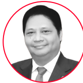
Airlangga Hartarto Coordinating Minister for Economic Affairs