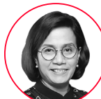
Sri Mulyani Indrawati Minister of Finance of Indonesia