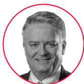
Mathias Cormann Secretary-General of the OECD

Session 1: The G20 role in supporting developing countries in G20/OECD IF BEPS and The Global Forum on Transparency and EOI for Tax Purposes