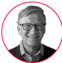
Bill Gates (TBC) Philanthropist co-founder Bill Gates and Melinda Gates Foundation

For further information please contact finance.logistics@g20-indonesia.id