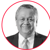
Perry Warjiyo Governor of Bank Indonesia