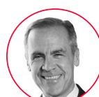
Mark Carney (TBC) UN Special Envoy on Climate Action and Finance

For further information please contact finance.logistics@g20-indonesia.id