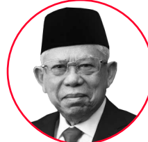
Ma'ruf Amin Vice President of Republic of Indonesia

Casual Talk: Drawing a Synergized Digital Strategy to Accelerate Next-level Economic Recovery Joint-Statement: Indonesia Digital Economy and Finance: Growing Further Together