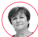
Kristalina Georgieva Managing Director of the International Monetary Fund