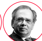
Paulo Guedes Minister of the Economy of Brazil