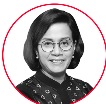
Sri Mulyani Indrawati Minister of Finance of Indonesia