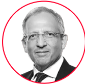
Jon Cunliffe Chair of the Committee on Payments and Market Infrastructures (CPMI) & Co Chair of FSB Cross Border Payments Coordination Group