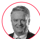
Mathias Cormann Secretary-General of the OECD