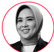
Aida S. Budiman Deputy Governor of Bank Indonesia