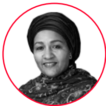
Amina J. Mohammed (TBC) Deputy Secretary General United Nation