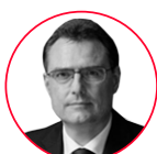
Thomas Jordan Governor of the Swiss National Bank