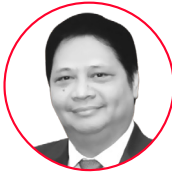
Airlangga Hartarto Coordinating Minister for Economic Affairs