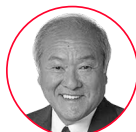
Shunichi Suzuki Minister of Finance of Japan (TBC)