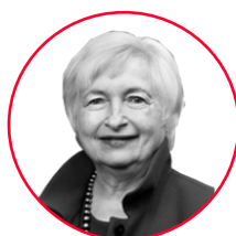
Janet Yellen Secretary of the US Treasury