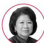
Mari Elka Pangestu (TBC) Managing Director of Development Policy and Partnerships World Bank