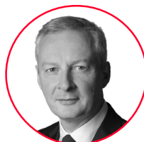
Bruno Le Maire (TBC) Minister of Economy, Finance, and Industrial and Digital Sovereignty of France

For further information please contact finance.logistics@g20-indonesia.id