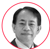
Masatsugu Asakawa President of ADB

Session 2: Future tax policy challenges, particularly tax incentives and domestic resource mobilization