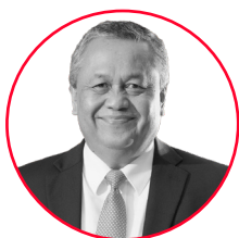
Perry Warjiyo (TBC) Governor of Bank Indonesia

Bali Nusa Dua Convention Centre Bali, Indonesia