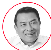
Moeldoko Chair of Periklindo Chief of Staff of Presidency

For further information please contact finance.logistics@g20-indonesia.id