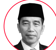
Joko Widodo President of The Republic Indonesia