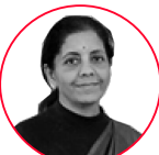
Nirmala Sitharman Minister of Finance and Corporate Affairs of India