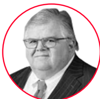
Agustin Carstens General Manager Bank for International Settlements