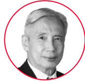
Felipe Medalla Governor of the Bangko Sentral ng Pilipinas

Industry Response To Cross Border Payment Initiatives ASEAN Banker's Association and International Fintech Association