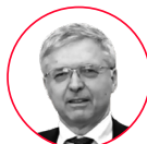
Daniele Franco Italy Finance Minister (TBC)