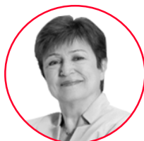
Kristalina Georgieva Managing Director of the International Monetary Fund