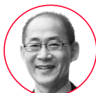
Hoesung Lee IPC Chair