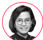
Sri Mulyani Indrawati Minister of Finance of Indonesia