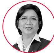
Destry Damayanti Senior Deputy Governor of Bank Indonesia