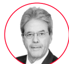
Mr. Paolo Gentiloni European Commissioner for Economy