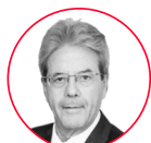
Mr. Paolo Gentiloni European Commissioner for Economy

For further information please contact finance.logistics@g20-indonesia.id