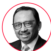
Junda Agung Deputy Governor of Bank Indonesia