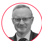
Phillip Lowe Governor of the Reserve Bank of Australia