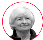
Janet Yellen Secretary of the US Treasury (TBC)