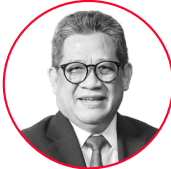
Doni Primanto Joewono Deputy Governor of Bank Indonesia