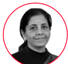
Nirmala Sitharaman Minister of Finance and Corporate Affairs of India (TBC)