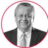
Perry Warjiyo Governor of Bank Indonesia