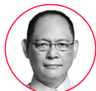
Benjamin Diokno Secretary of Finance of Philippines (TBC)