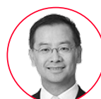
Eddie Yue Chief Executive of the Hong Kong Monetary Authority