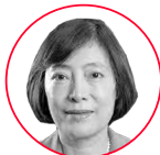
Hu Xiaolian Chairman of Export Import Bank of China (CEXIM)