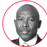
Lesetja Kganyago (TBC) FSB-CPC and Governor of Reserve Bank of South Africa

Casual Talk: Faster, Cheaper, More Transparent, and More Inclusive Cross-Border