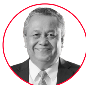
Perry Warjiyo Governor of Bank Indonesia