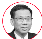
Liu Kun Minister of Finance of People's Republic of China (TBC)