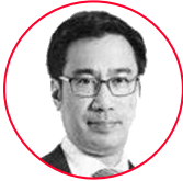
Sethaput Suthiwartnarueput Governor of Bank of Thailand

Casual Talk: Faster, Cheaper, More Transparent, and More Inclusive Cross-Border