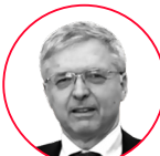
Daniele Franco Minister of Economy and Finance of Italy