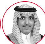
Mohammed bin Abdullah Al-Jadaan Minister of Finance of Saudi Arabia